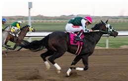
DESTELLO DE LUNA , winner 2021 Alberta Bred (RG3) Futurity, 2 nd Sale Stakes Futurity, 3 rd Alberta Stallion Stakes Futurity