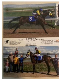
O SEEYALATER , winner 2022 Alberta Stallion Stakes, 2023 winner Alberta Stallion Stakes Maturity