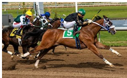
BEARCAT BILL winner 2022 Canada Cup Derby, winner 2022 Alberta Bred Derby